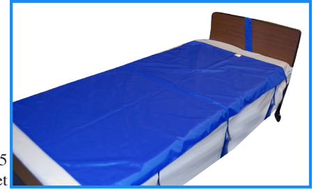
556065 Universal Glide Sheet