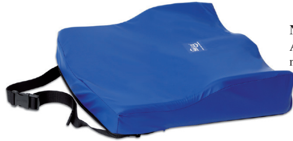
New Visco Anti-Thrust Cushion model# 753160