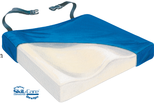
Conform Cushion model# 753150