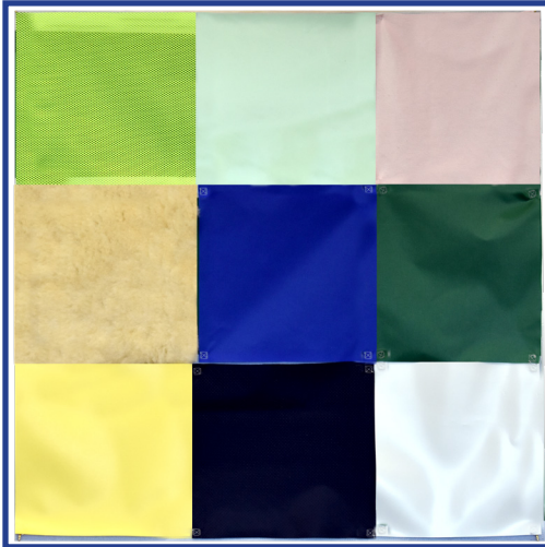
Texture Panel (A)