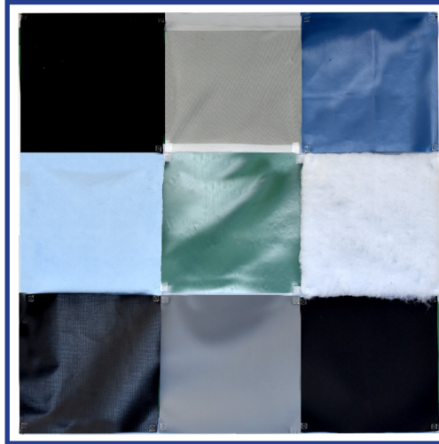
Texture Panel (B)